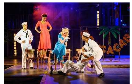
On the Town