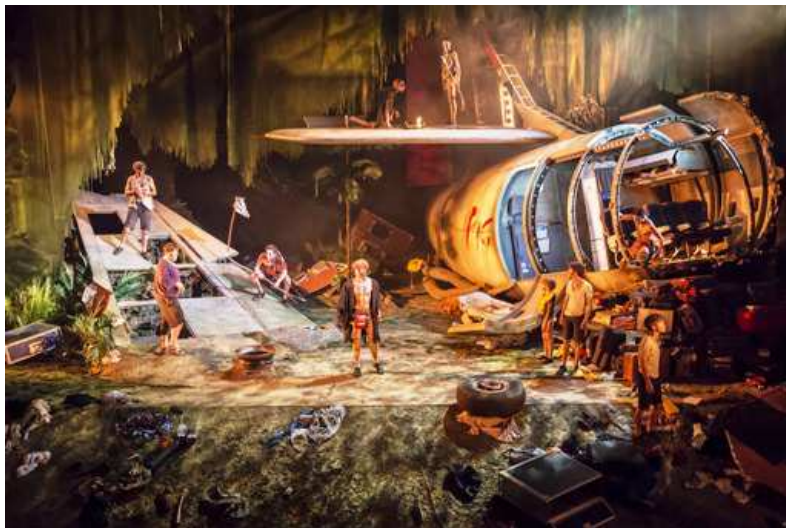
Lord of the Flies