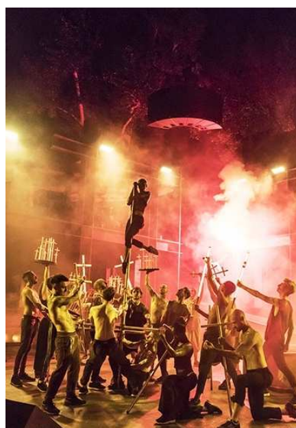
Jesus Christ Superstar