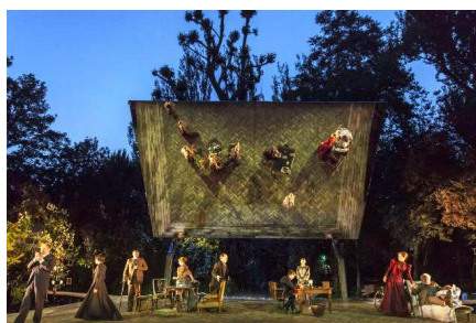
To Kill a Mockingbird