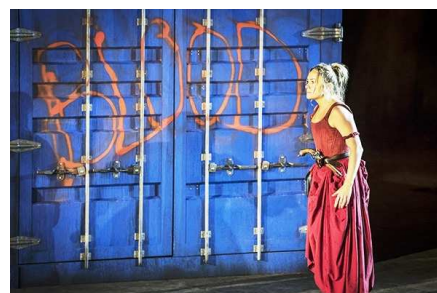
A Tale of Two Cities