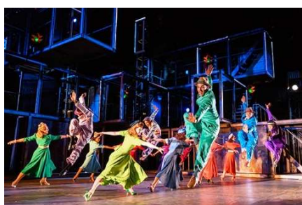
On the Town