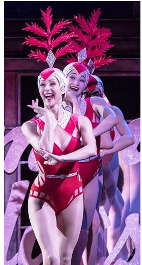
On the Town