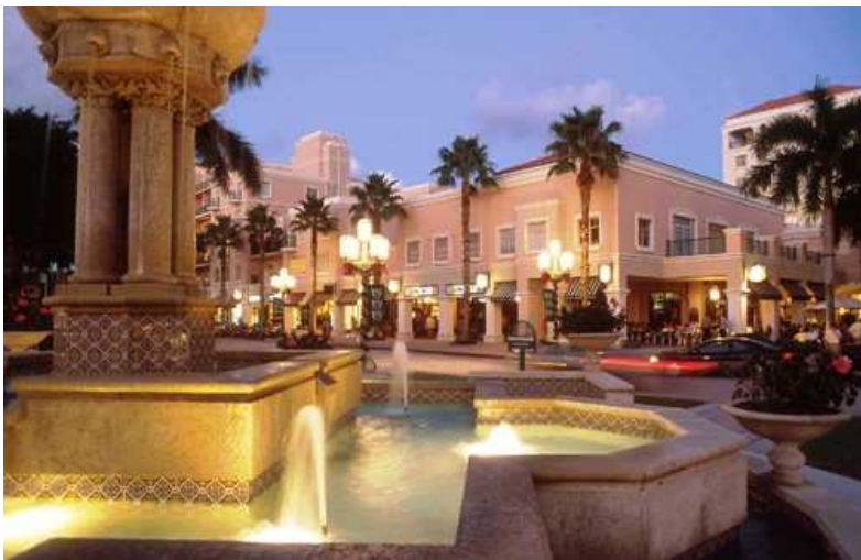
Downtown Boca Raton