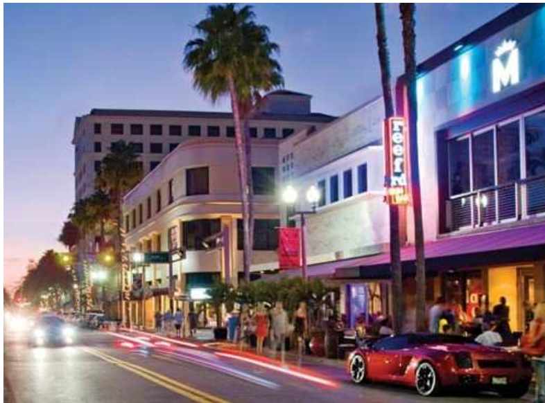
Clematis Street, West Palm Beach