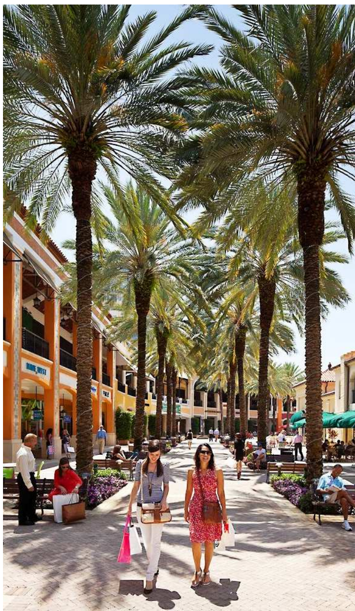
West Palm Beach