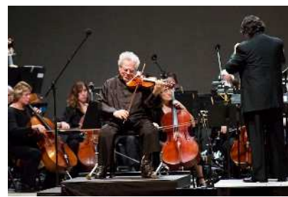
Festival of Arts

In addition to the every day attractions and entertainments, the Palm Beaches stages a number of major annual events that can enhance a visit.