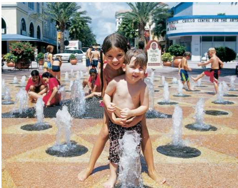
West Palm Beach