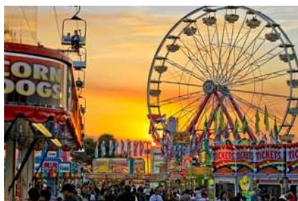
South Florida Fair